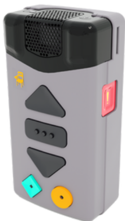
FrontRow Action! Mics by Boxlite

This two-way communication setup is particularly beneficial in critical situations, as it ensures teachers can alert administrators immediately with a simple button press on their wearable devices. Peggy also noted that FrontRow's wearable devices have been strategically assigned based on specific roles. For example, PE teachers and staff who may not have the wearable microphones are provided with a separate wearable panic button, further enabling them to alert administrators if necessary. "We're going to have certain people on the staff who will have the wearable panic button," she said. "We're planning to distribute these to teachers who don't have the wearable mic."